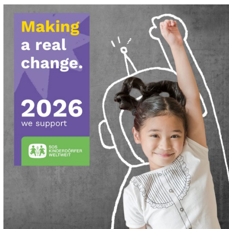
Instagram 1080 x 1080 px (png)