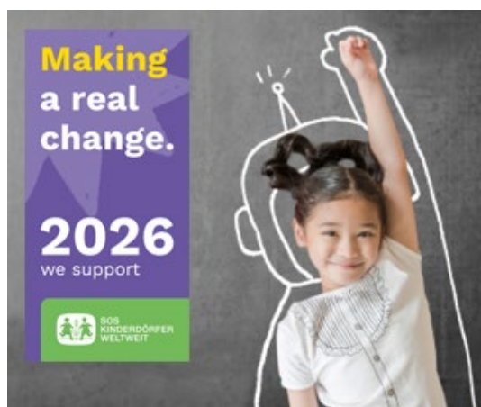
300 x 250 px (png)