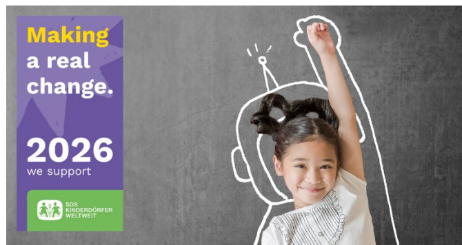
Facebook 1200 x 630 px (png)