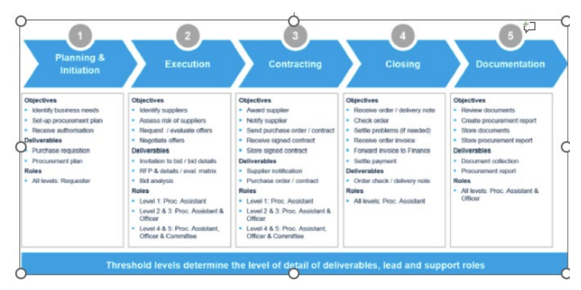
Table 5: SOS CV Procurement Process

6.4.10 The ISC procurement process adhered to the structured five-step approach starting from the planning and initiation of a purchase initiative and ending at the documentation of the initiative and storing all relevant documents (Table 2).