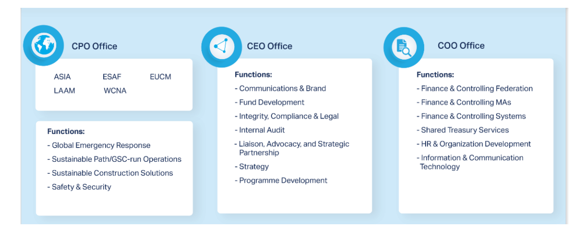
Figure 2. Functions of the current Executive Board as of 31 March 2023.